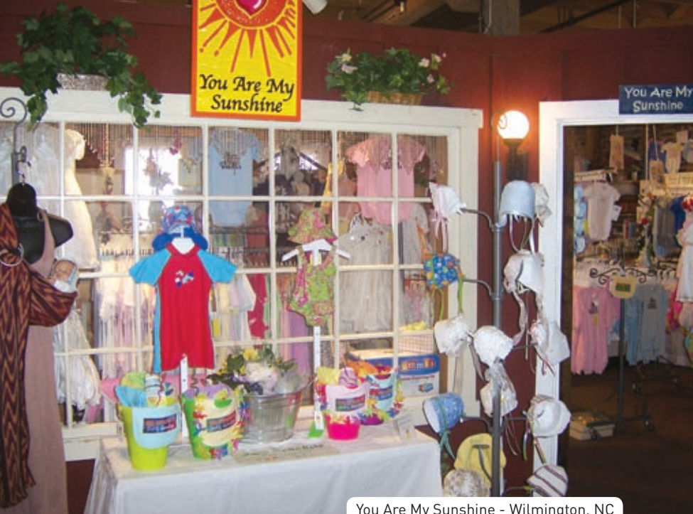
You Are My Sunshine - Wilmington, NC

No matter where in the U.S. they may call home, tiny trendsetters everywhere are learning to love boutique-chic looks.